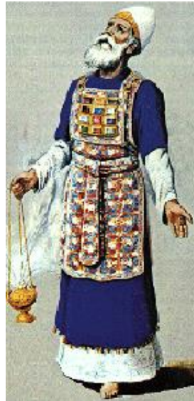
High Priest with Urim and Thummim breastplate