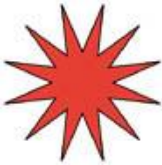
12 pointed star